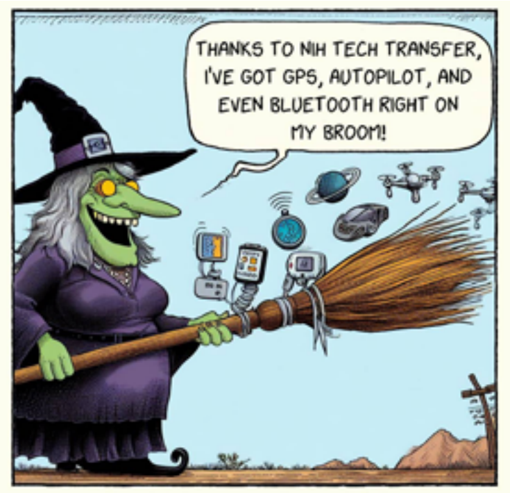
THE DANGERS OF COLLECTING TESTIMONIALS AROUND HALLOWEEN

Tech Toon: Testimonials Wayne Pereanu, OTT