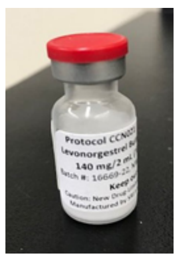
LB contraceptive injection.