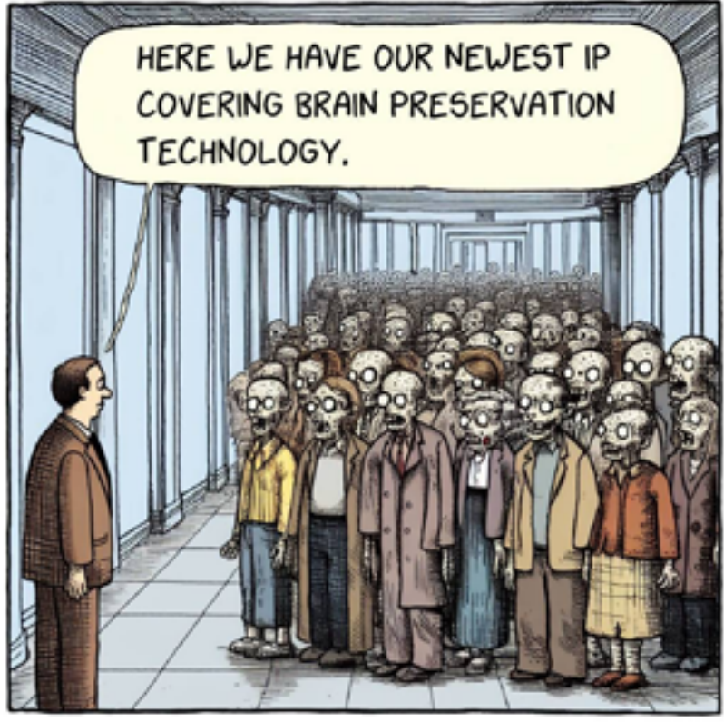
ALWAYS CRAFT YOUR MESSAGING FOR YOUR INTENDED MARKET

To request an account, contact Kevin McLam at <u>kevin.mclam@pitchbook.com</u>. There is not currently a cap on how many accounts we can have, so please request one if you would benefit from the resource! Online training and tutorials are available on the website.